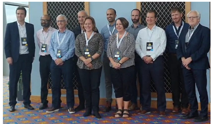
REMAP-CAP ITSC at CCR22 in Belfast

Global Chair of the International Trial Steering Committee European Coordinating Investigator